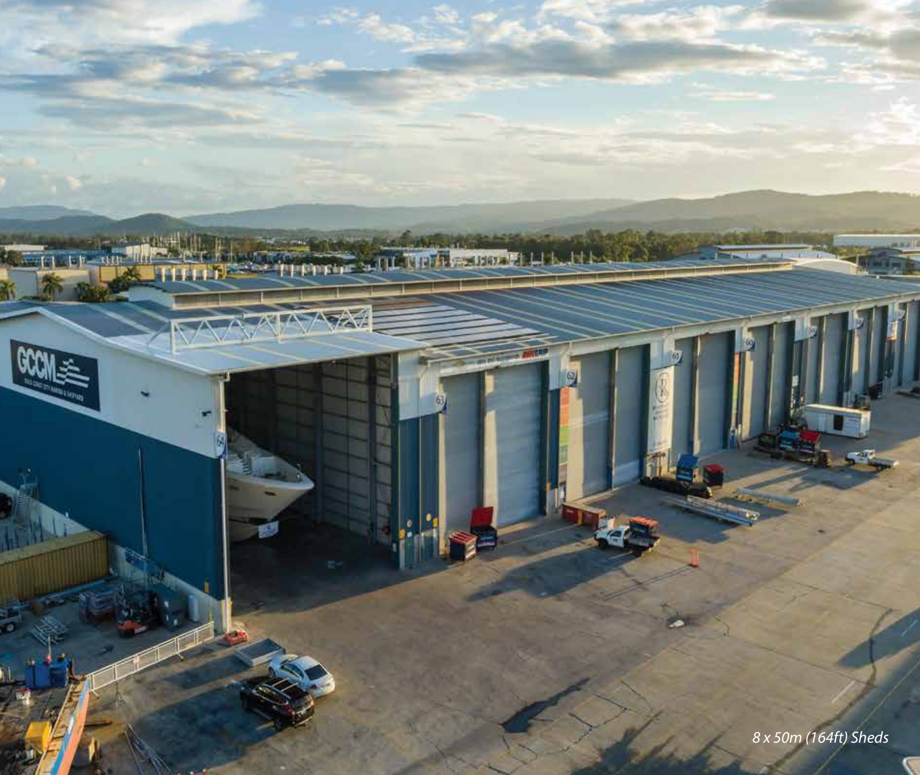
8 x 50m (164ft) Sheds