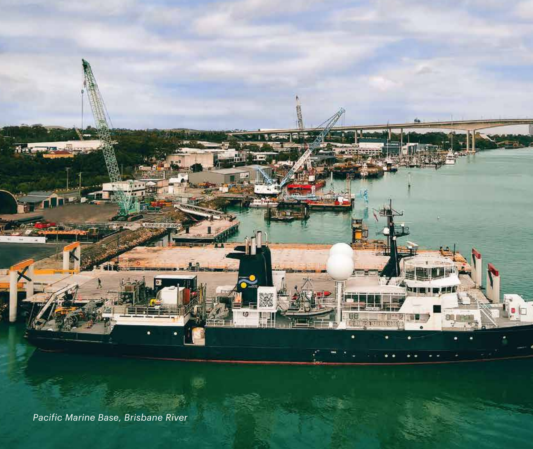
Pacific Marine Base, Brisbane River