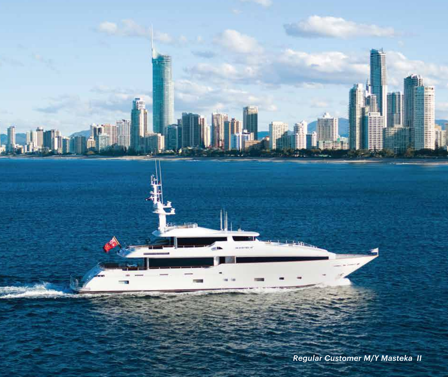
Regular Customer M/Y Masteka II